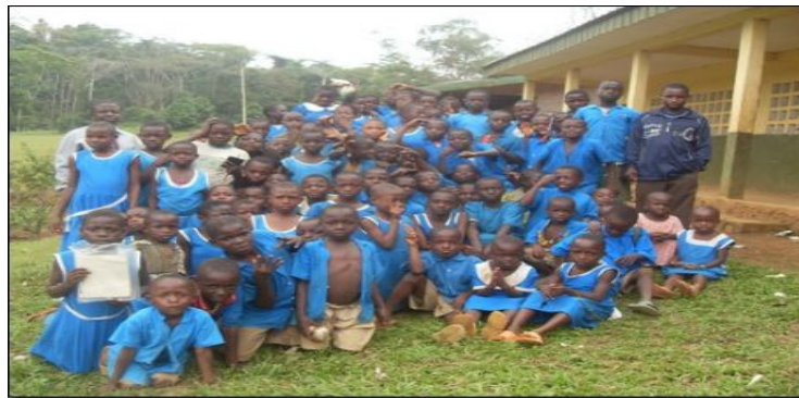
Government Primary School Big Bekondo

Oroko is a tribe located in Ndian and part of Meme Divisions of Southwest Cameroon Region in Central/West Africa. Oroko means "Welcome" in the dialect of Oroko people and the tribe is made up of 10 Clans, each with several villages that make up the 213 villages. Over the years, the numbers of inhabitants in many of these villages are becoming smaller due to geographical or economic mobility. Most of the geographical areas have no roads making it impossible for communication during the raining seasons. It is sad that even during the dry seasons, it takes three to four days to reach some of the villages. As a result, there is a lack thereof or a tremendous shortage in some areas of medical supplies, doctors, nurses, teachers and school supplies. Death rate has increased greatly among the elders and children while birth rate has decreased. There are several young children who have dropped out of schools for lack of school fees, books, uniforms, food, and good health. It is apparent that due to the afore-cited reasons, the population of the Oroko land has stagnated around the 130,000 people whereas neighboring divisions with improved social amenities are in the upper 200, 000 people.