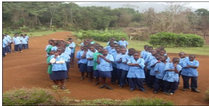
Gov't High School Dikome Balue