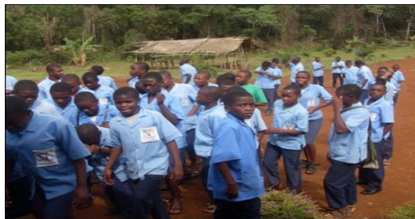
Gov't High School Dikome Balue