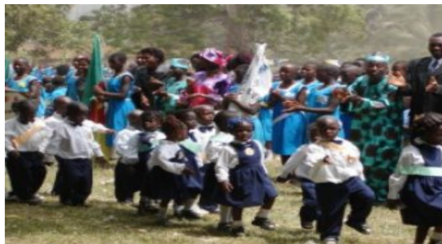
Nursery School Big Bekondo

Books for Africa is willing to donate 22, 000 textbooks from K-12 for these Students in Cameroon. Please visit their website https://www.booksforafrica.org/donate/to-project.html?projectId=52 for more detail. The collection of books will be developed with the school curriculum primarily in mind. All textbooks for Nursery, Primary, Secondary, and High schools in subjects such as World and African History, Mathematics, Science, English, English Literature, Biology, Chemistry, Business, Computer Science, Economic, Education, Engineering, French, French Literature, Grammar, Philosophy, Physic, Sociology, Psychology, Religion, Geography, Banking, and Marketing, General leisure reading, Reading skills, Social Studies, English language skills, Science, Math, and Health will be provided to the village schools.